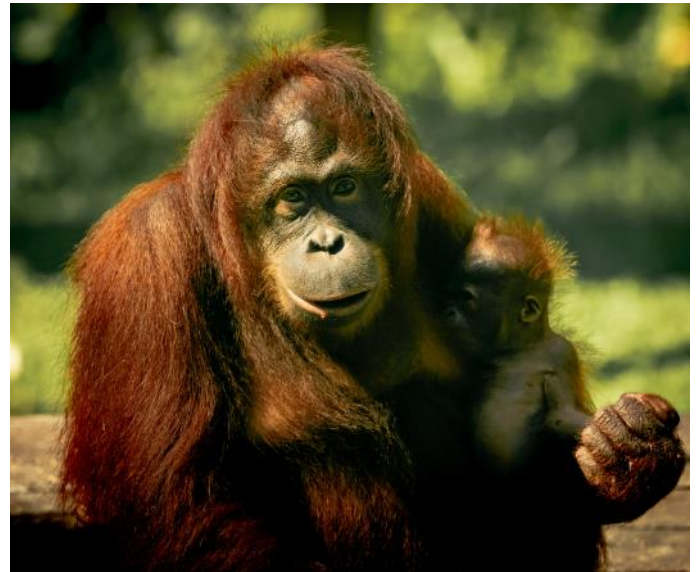
An orangutan with baby.

And last, we had a chance to see Sandakan town, with its old and new buildings.